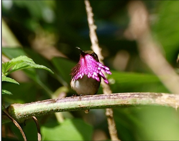
Wine-throated Hummingbird