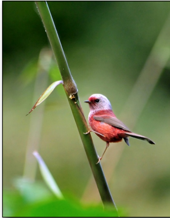
Pink-sided Warbler