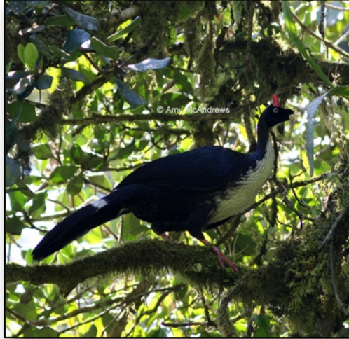
Horned Guan

new trip by High Lonesome BirdTours. By the way, for you coffee lovers it doesn't get any better than Guatemala. We spent several nights in two different coffee "fincas" or plantations, and we sampled some great coffee!