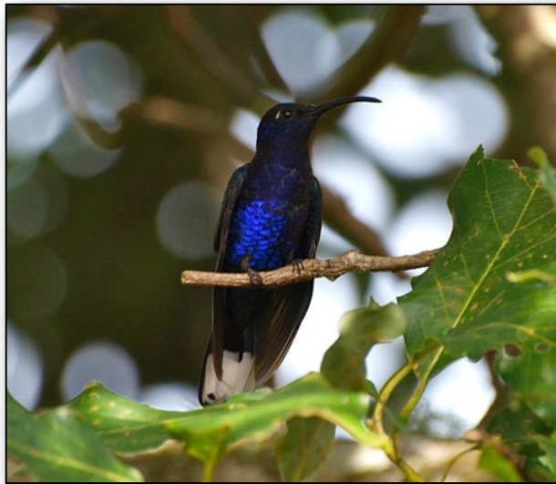
Violet Sabrewing

On our scouting trip in July, it was not a good time of the year for Resplendent Quetzal, but they are known to be common and easily seen in the months of February and March. We hope to see the rare Belted Flycatcher at Laguna Lodge in Lake Atitlan as well.